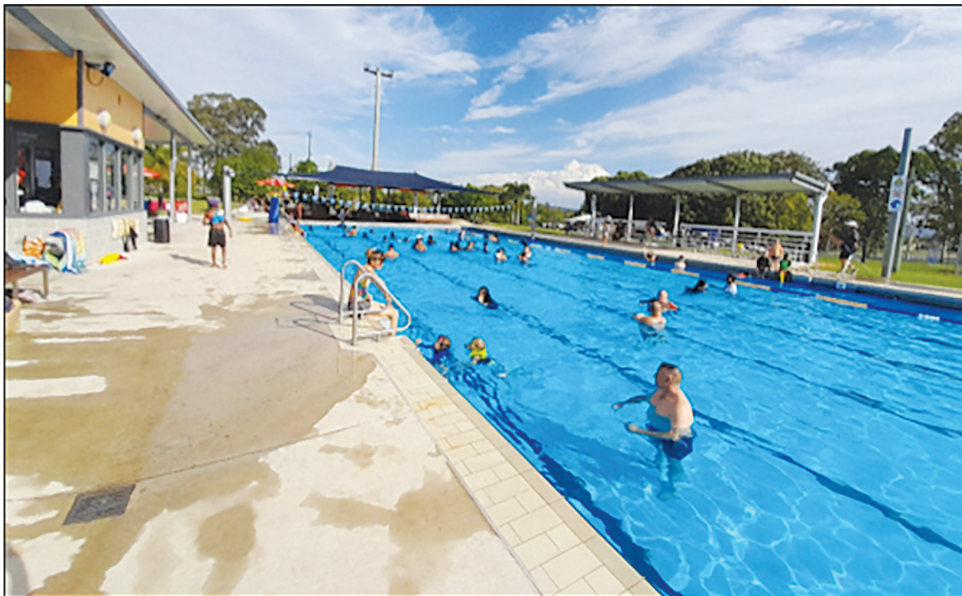
The BYTE NITE Christmas break up at the Murgon Pool