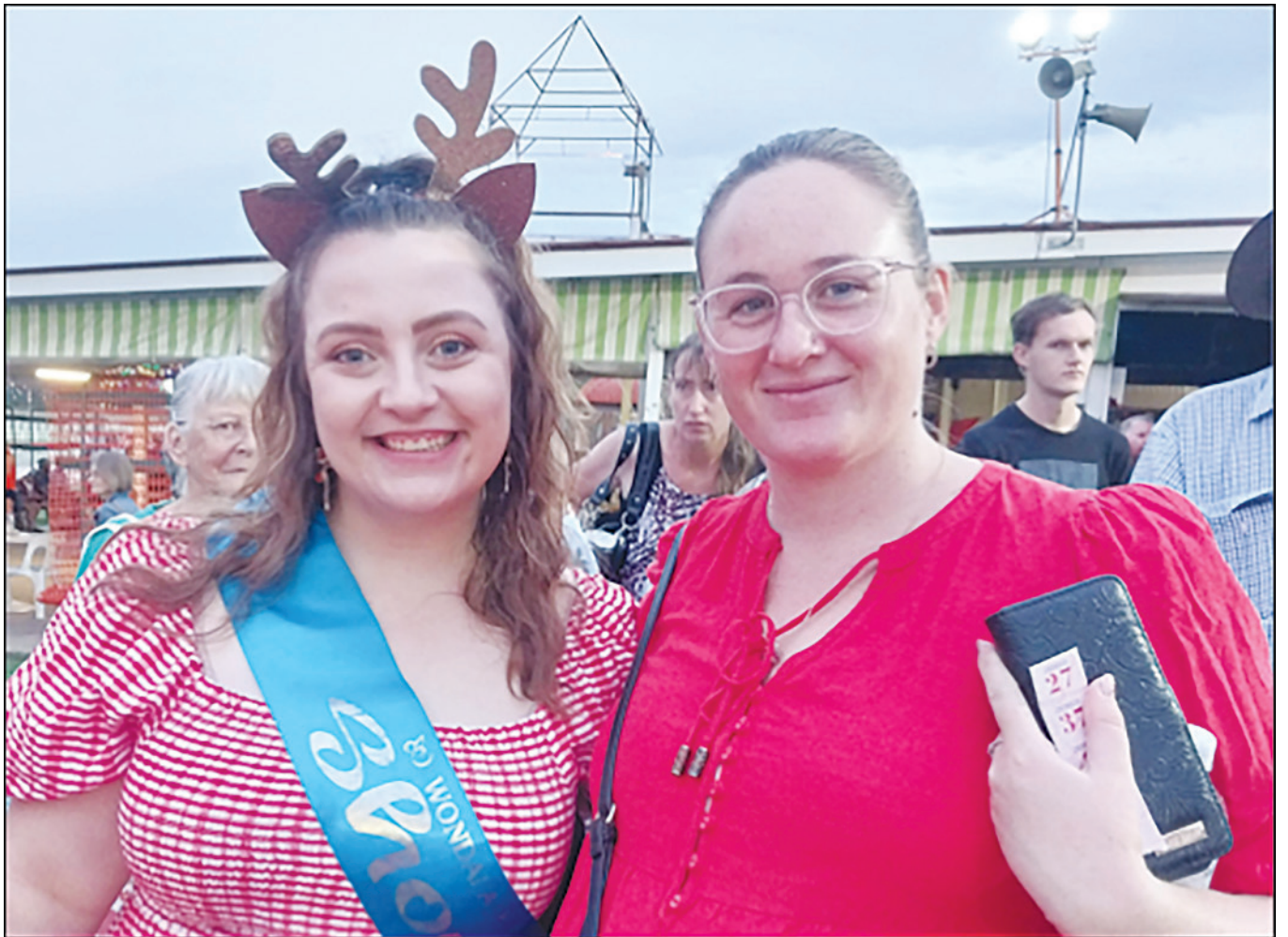
Enjoying Christmas Eve at Wondai Christmas Carnival