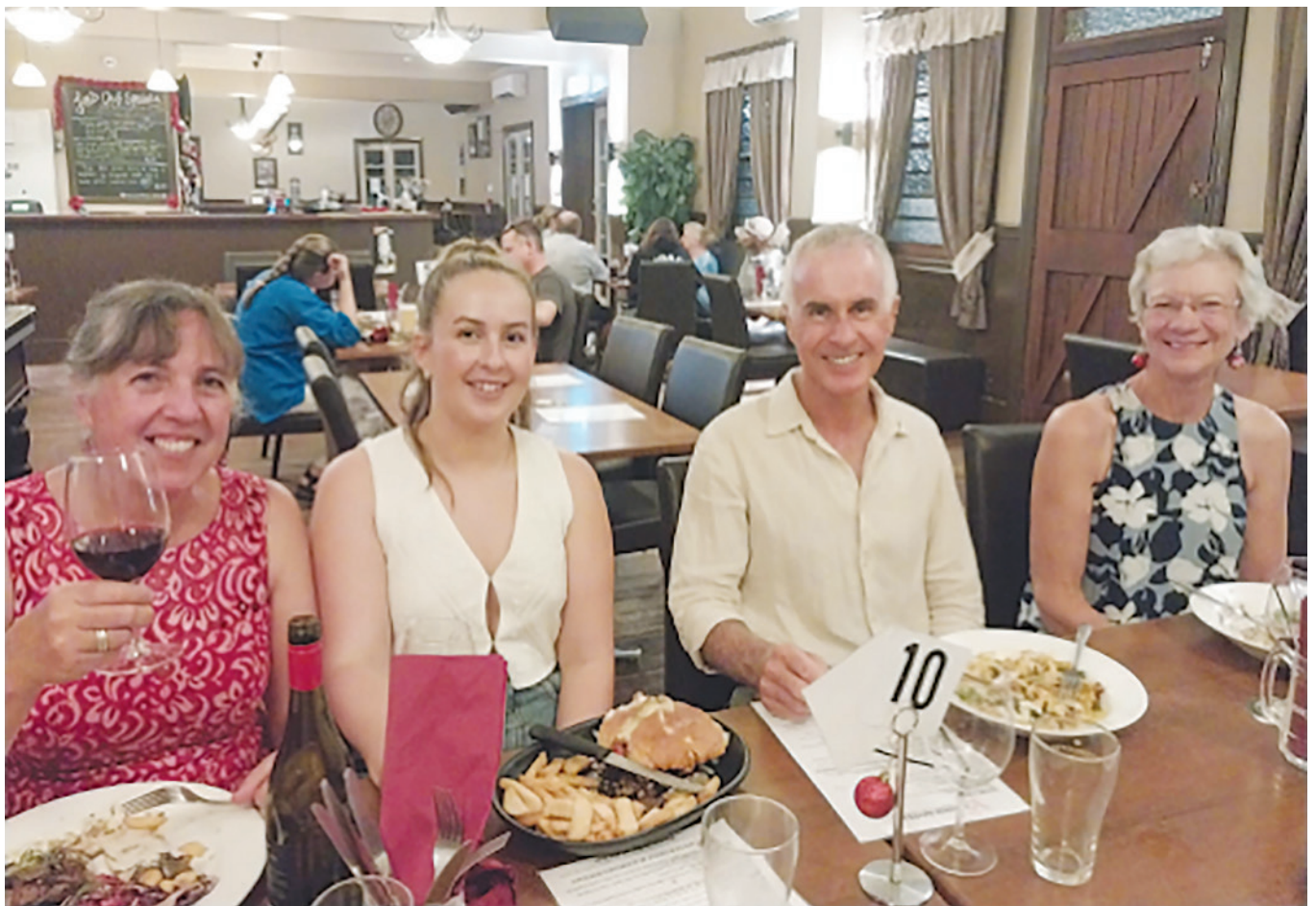
At BIEDO's Christmas Breakup.