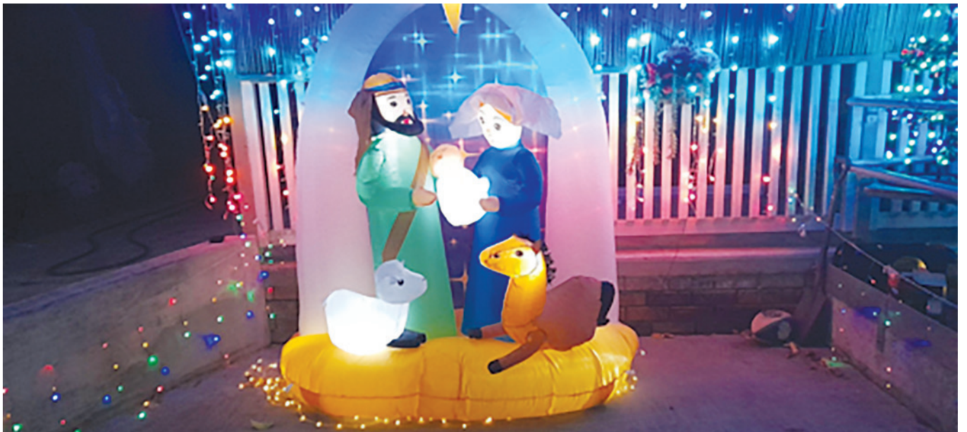
Judging the Christmas lights at Cherbourg. The magnificent displays made it incredibly hard to choose 1st, 2nd, 3rd & 4th!!