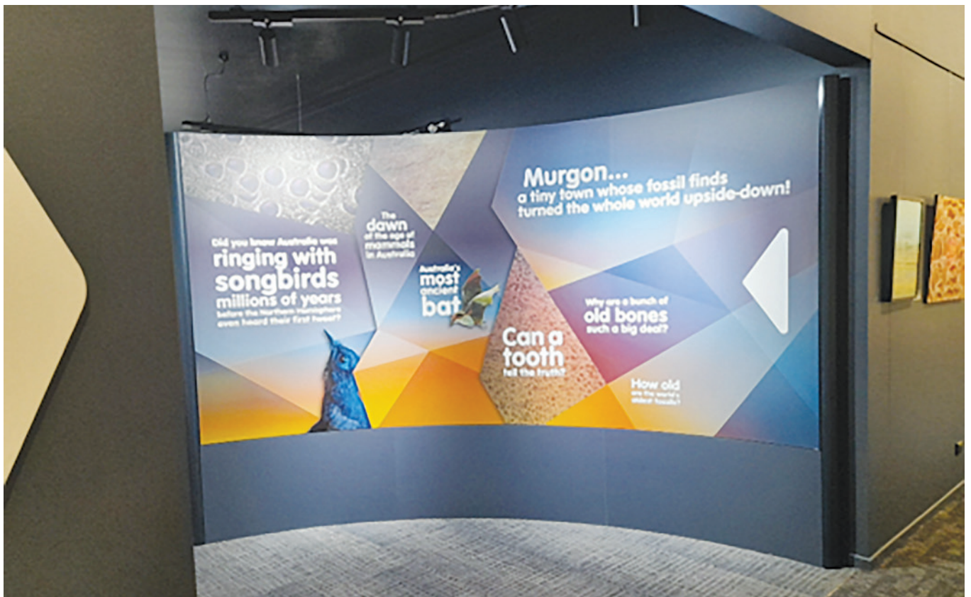
The entrance to the “55million years ago” fossil experience museum