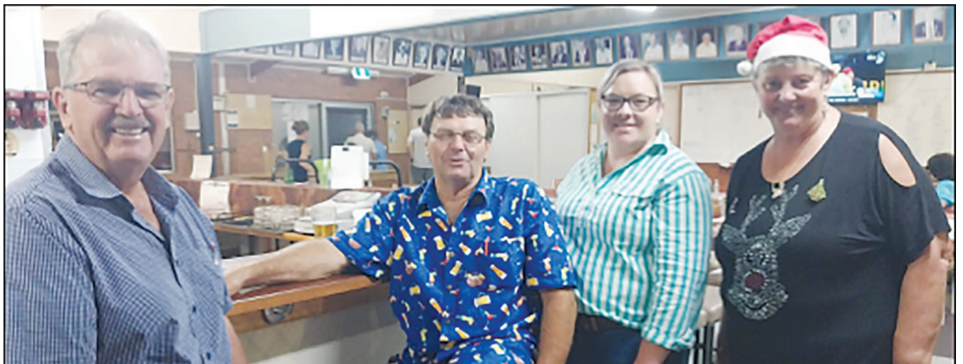
Enjoying barefoot bowls at the Murgon Business & Development Assoc Christmas Break Up