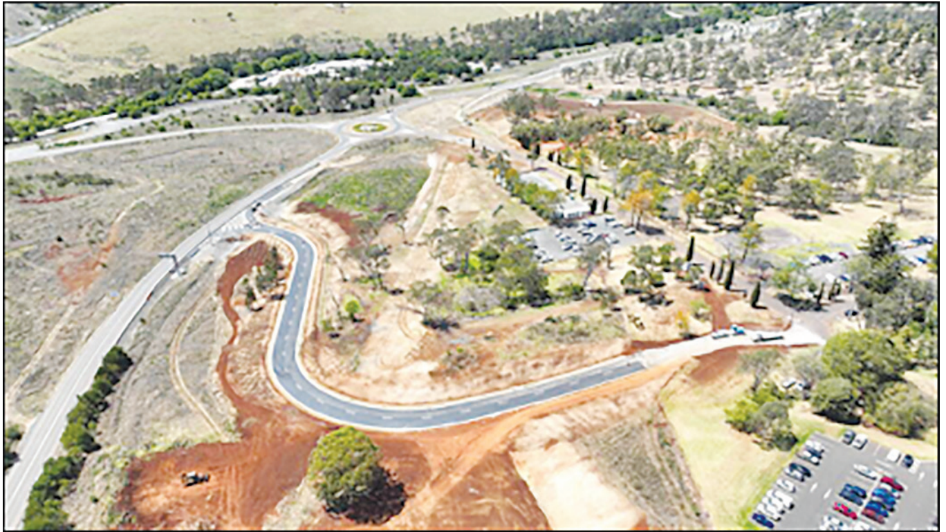
Site of the new Toowoomba Hospital at the Baillie Henderson Hospital campus

One of the key steps ahead of construction the new Toowoomba Hospital build is now complete, with enabling works recently concluding.