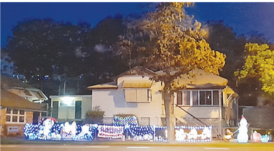
Goomeri Police Residence