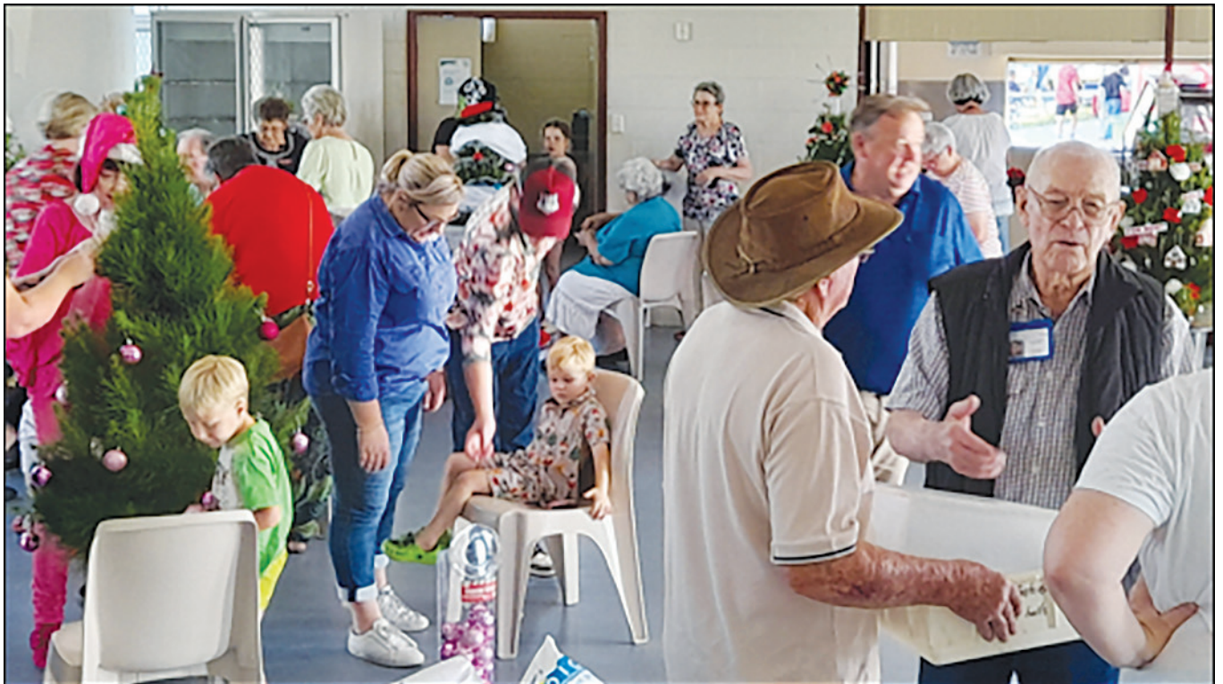
A lot of advice being given to what a Christmas Tree should look like at the Murgon Bush Christmas Carnival