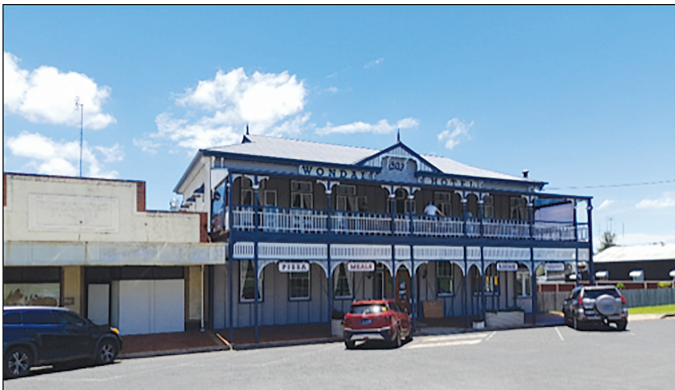
The freshly painted and restored Wondai Hotel