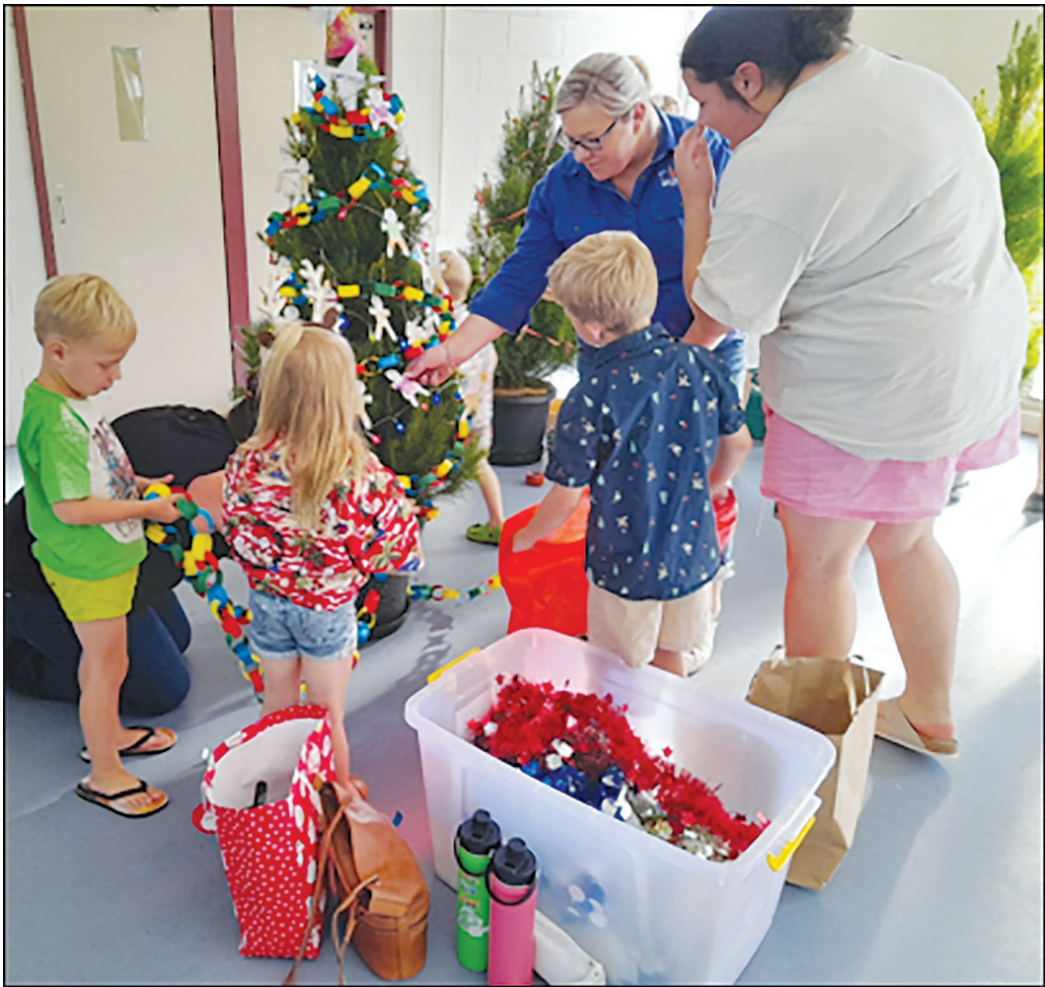
Decorating the Christmas Tree at the Murgon Bush Christmas Carnival