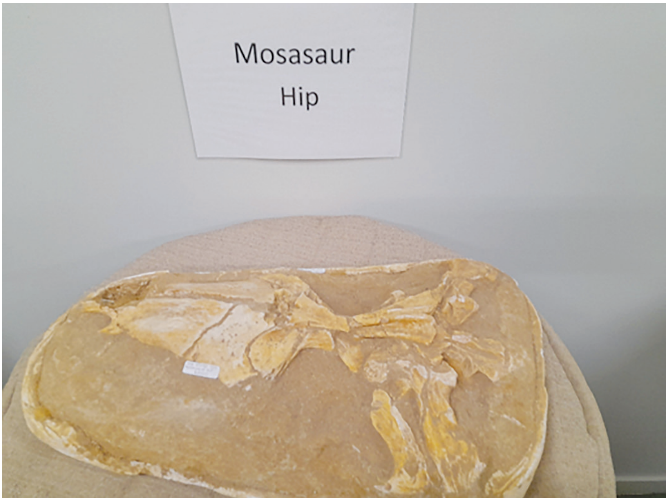
The Fossilarium part of the “55million years ago” fossil experience museum