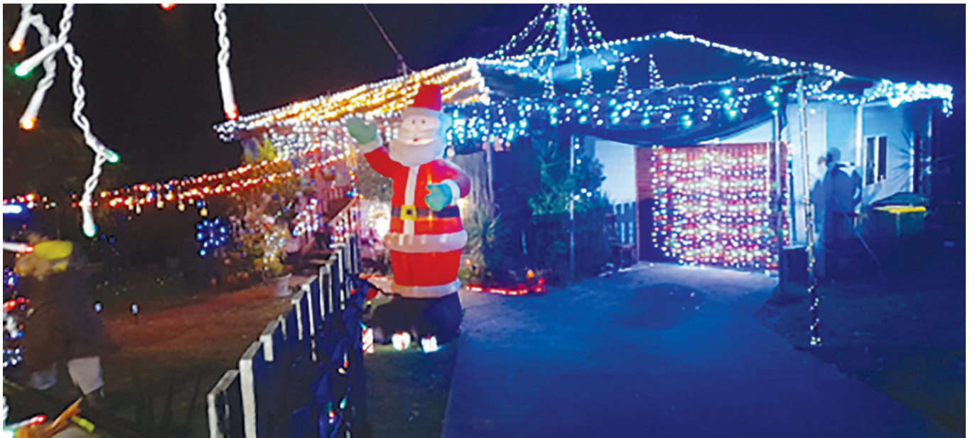
Just some of the Amazing Christmas Lights at Cherbourg