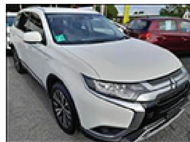
2018 MITSUBISHI OUTLANDER ES AWD ADAS WAGON 2.4LIT 4 CYL, tow bar, t/bar auto, air con, one log book owner $28,790 Drive away