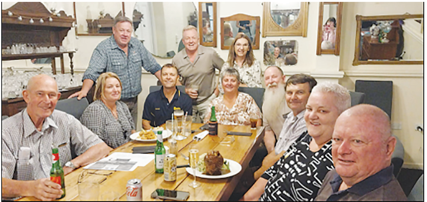
A well attended Annual Meeting of the Murgon Business & Development Association Inc