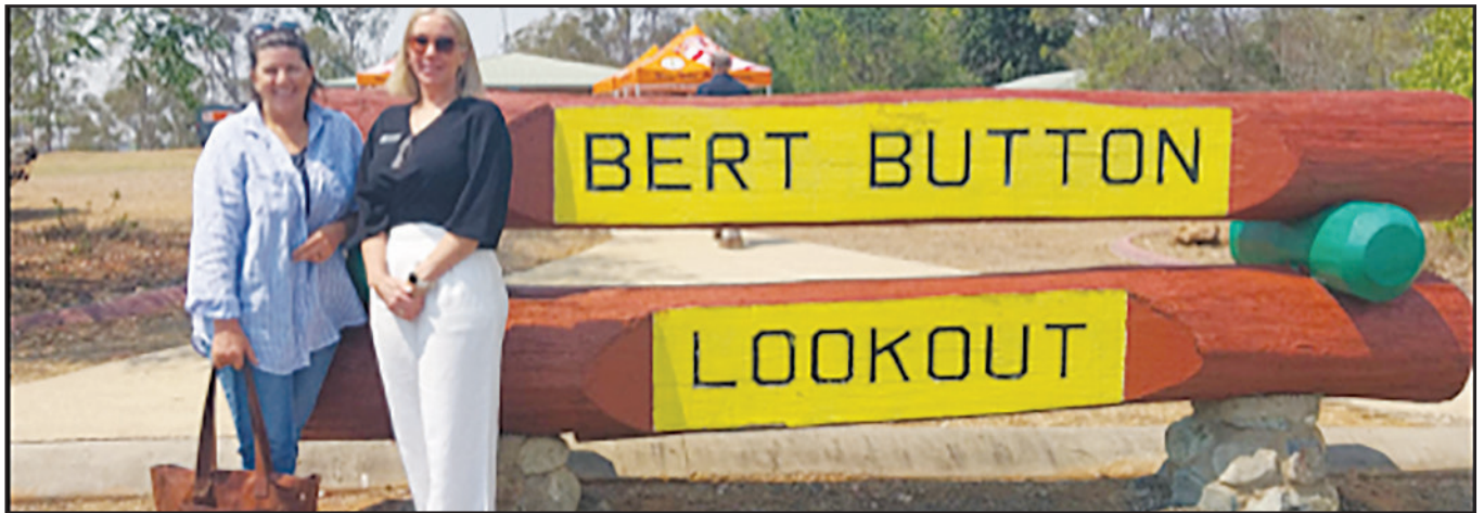
New shop opens at Bert Button Lookout at Cherbourg