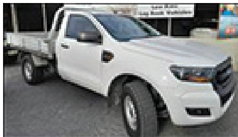
2016 FORD RANGER HI RIDE MK2 4X2 UTILITY Tow bar, auto, air con, alloy tray, blue tooth, cruise control. $25,990 Drive Away