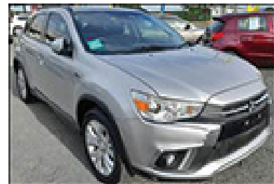
2018 MITSUBISHI ASX ES ADAS SUV WAGON 2.0 lit 4 cyl, tow bar, air con, auto, one log book owner, $26,990 Drive Away