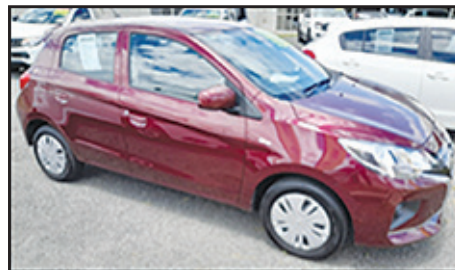
2021 MITSUBISHI MIRAGE ES H/Back , one local log book owner, under new car wty, only 6,000km, t/bar auto, fog lights, air con, $19,790 drive away.