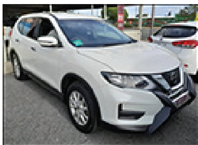
2018 NISSAN X TRAIL, SUV ST 2WD, SER 2 WAGON, 2.4 lit 4 cyl, auto, tow bar, air con, one log book owner, $26,490 Drive Away