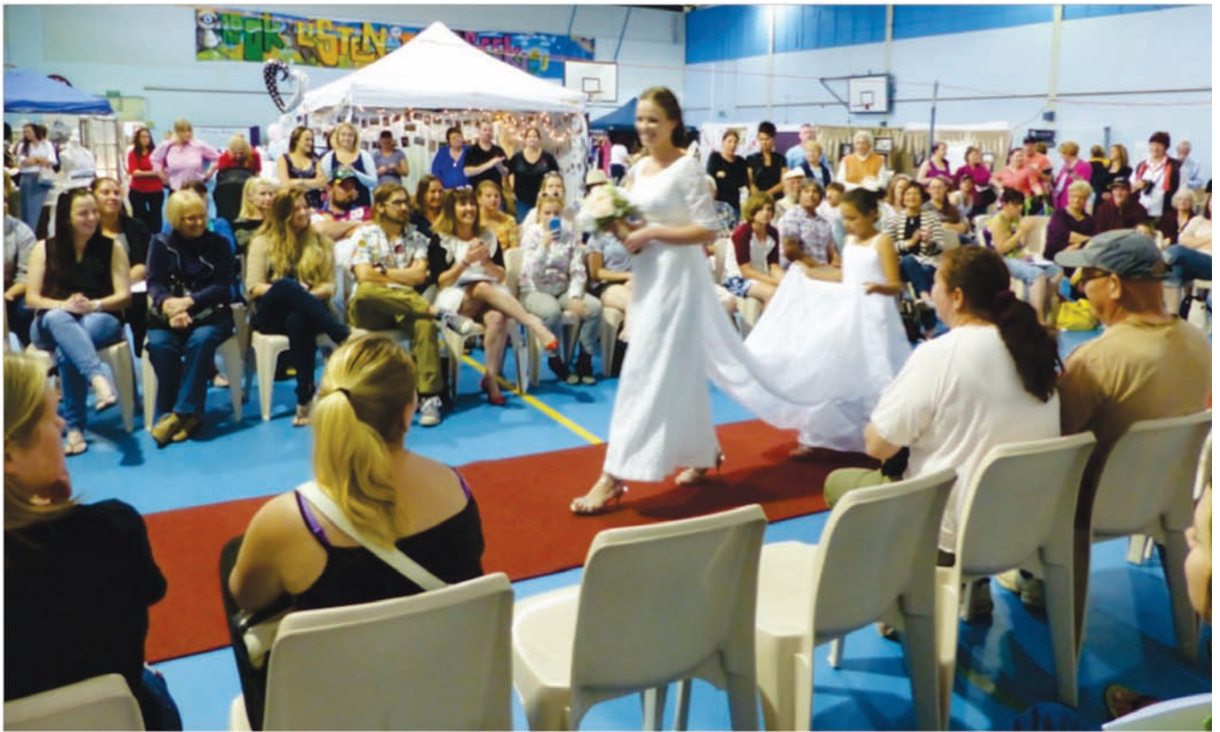
Over 40 would be Brides registered at the SB PCYC Bridal Expo held in Murgon. The large crowd was appreciative of the many fine stalls set up and the Bridal fashion parade.