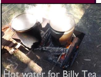
Hot water for Billy Tea